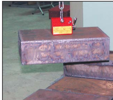
Center magnet on most workpieces to lift.