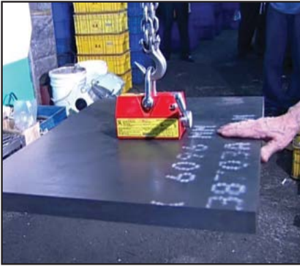
3.5 X Safety Factor above rated load capacity