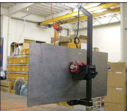
Vertical Lifters can be operated by one person.