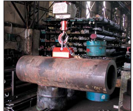
Beveled bottom surface lifts round stock.