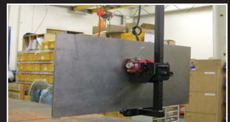
Vertical Lifters for a variety of stock shapes

Order EZ-Lift thru your local Techniks distributor.