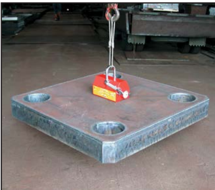
Eliminate straps, slings and associated dangers.