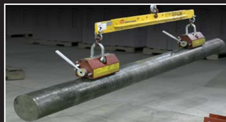
Magnets and spreader bars for large loads.