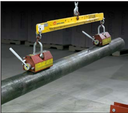
Use spreader bars for long, difficult round stock