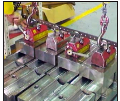
Use spreaderbars to gang stock in one operation