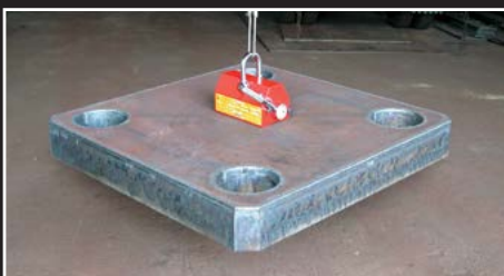
Load and unload plate, block, or round stock