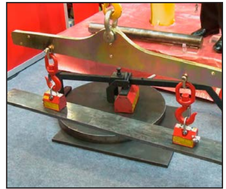
Spreader bars are used for long or very heavy loads.

We can test & re-certify your old lifters. Call us at: (800) 597-3921