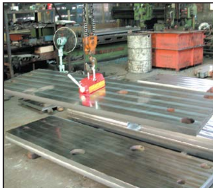
Locate magnet at balance point for lifting.