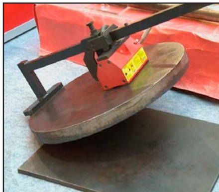
Move round or rectangular stock vertically.